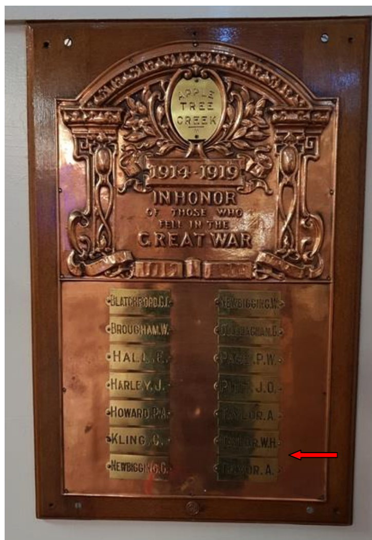
Apple Tree Creek Honour Board