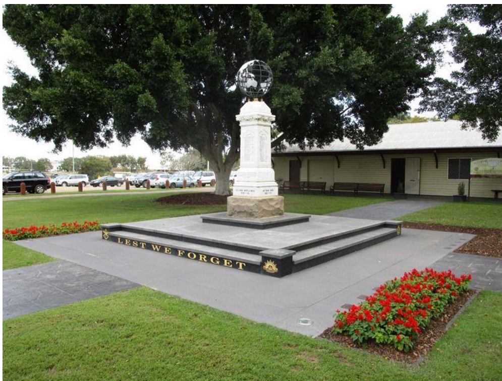
Pialba Memorial Cenotaph