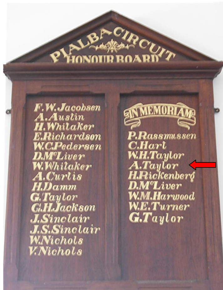
Pialba Circuit Honour Board