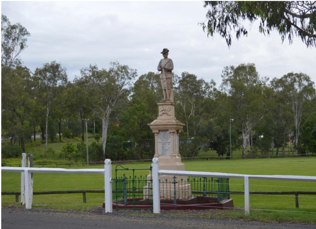
Apple Tree Creek War Memorial